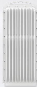
DIMETRA EXPRESS MTS1 TETRA SYSTEM