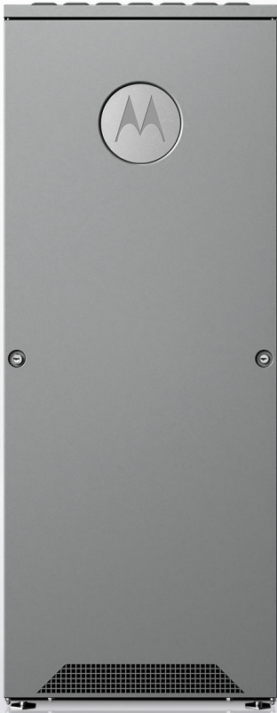
DIMETRA EXPRESS MTS4 TETRA SYSTEM