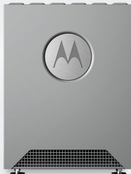
DIMETRA EXPRESS MTS2 TETRA SYSTEM